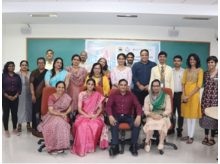
Health professionals who work with trans people, Manipal Workshop

A Queer Affirmative Health Professional: there are surgical procedures which are done on cis women but when demanded by people who are gender incongruent are denied – because somebody feels that it is not ethically right