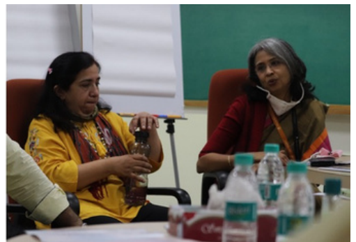
Medical educators, KMC Manipal workshop

A Queer Affirmative Health Professional: I remember that when the first [trans] person walked into my outpatient department, I immediately felt that I became this other person that I wasn't very proud of.