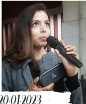
Photo News: 20.01.2023. Lecture on mental health